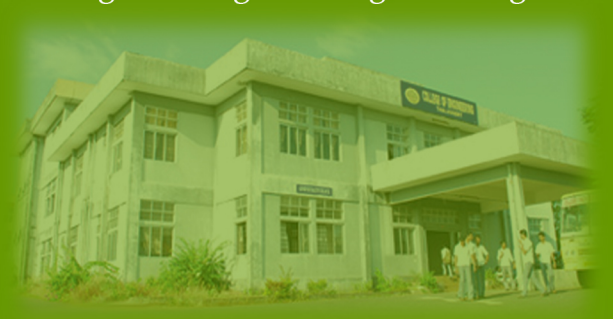
College of Engineering, Thalassery