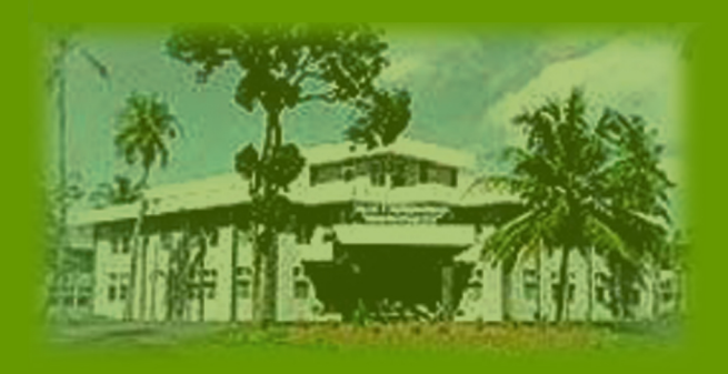
College of Engineering, Perumon