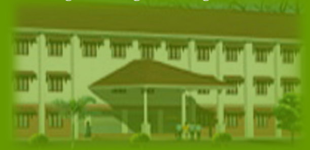
College of Engineering & Management, Punnapra